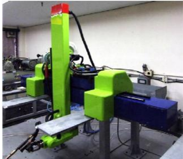
Figure 1: RRX4 Mobile Welding Robot [8]

Control system in robotic arc welding is categorized in two; open-loop system and closed-loop system. Open loop system is the basic concept of any control system in welding process, while closed-loop system is the improved system. There are optimal control, adaptive control, and intelligent control.